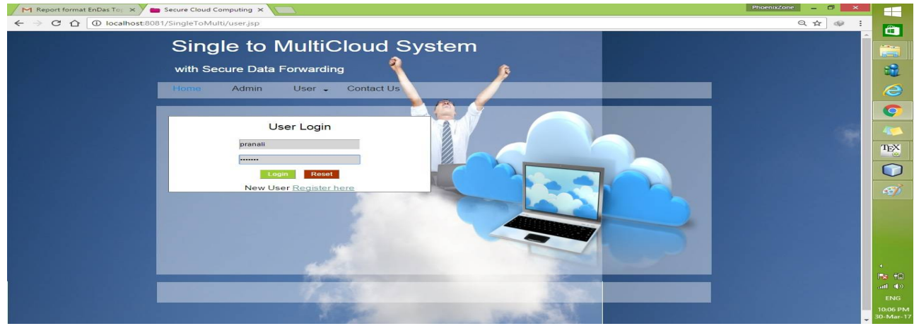
Fig. 4 User Login

User can enter token key and upload or download file.