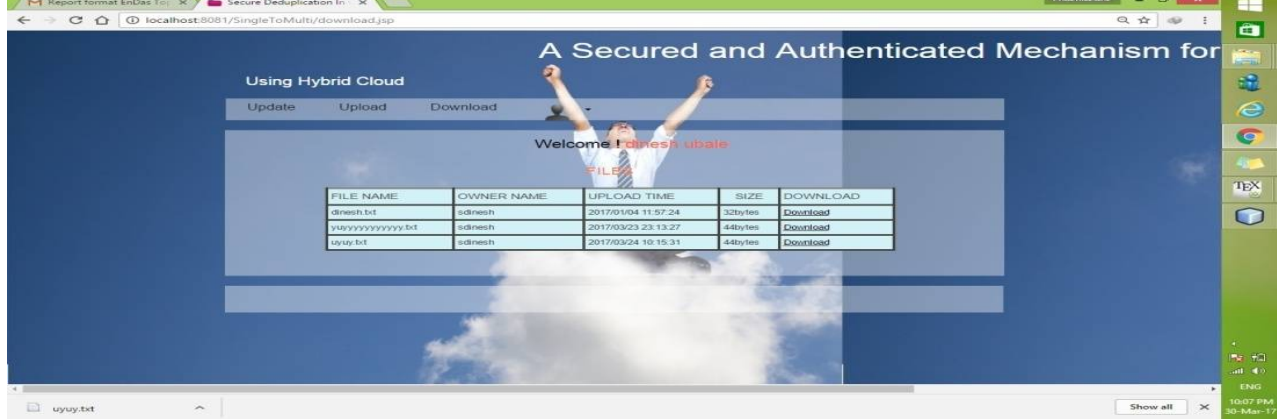
Fig6. Show details

User can enter token key and upload file. User can select file and upload file.